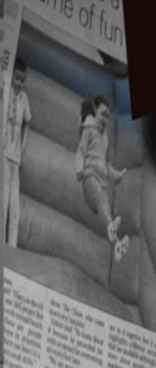
...the name of fun...