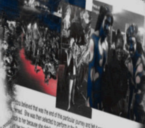
...the end of this particular journey and felt it was an experience enough for her to be selected to perform in the Pan-African closing ceremony. This came to her because she didn't really expect to be selected. This role in the Pan-African closing ceremony was not just for her to complete her steps but to be part of the celebration...