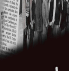
Debra Knight with Shaun Wallace from The Chase